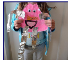
Lena's Blow Paint Monster