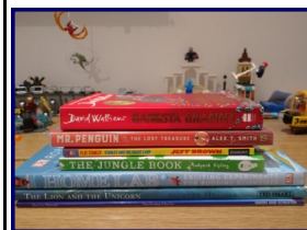
Sam's Rainbow books

Sam challenges you to make a rainbow from items from your house/garden.